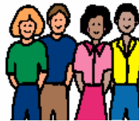
Staff / Visitors