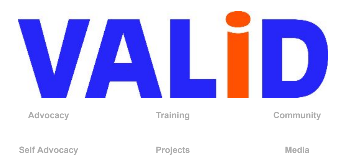
VALID e-newsletter issue #43 01/09/21