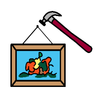
To ask permission before putting up any fixtures