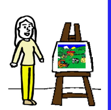
To be treated as an individual