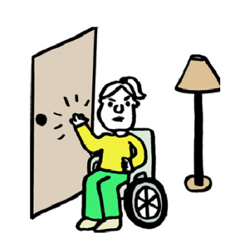
To respect the privacy of others