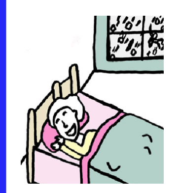
To feel safe in your home