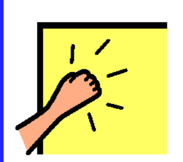
To privacy in your room etc.