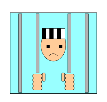
To not break the law