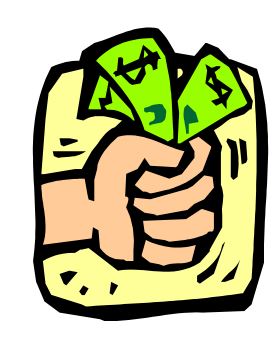
To pay your rent on time