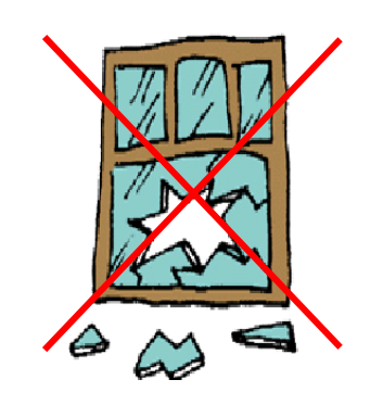
To not damage the house in any way