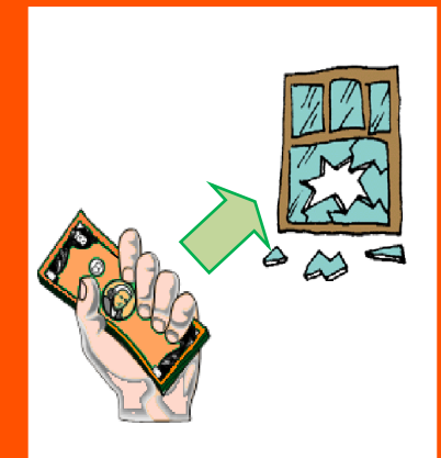
To pay for damage you do