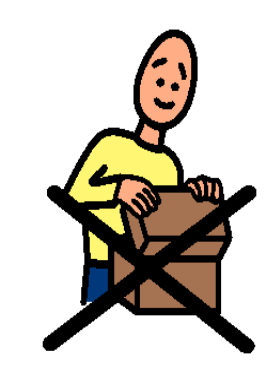
To not touch other people's things