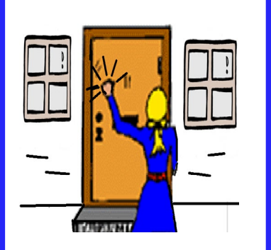
To see a Community Visitor